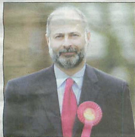
FABIAN HAMILTON (Lab, Leeds North East) - Leisure, Culture and the Creative Sector