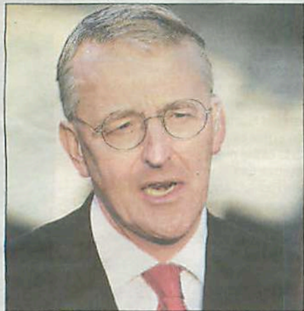
HILARY BENN (Lab, Leeds Central) - Education