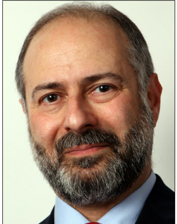
Fabian Hamilton MP for Leeds North East

Women, children and families will also be hit hard by the cuts. New school buildings are being cancelled. Spending per pupil is set to fall. Many families are having working family tax credits and child benefit taken away. University Tuition fees are set to double. There will be fewer police on the beat. Why aren't the bankers being asked to pay more? After all, it was them who caused this mess in the first place.