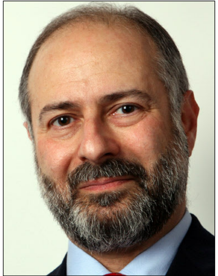
Fabian Hamilton MP for Leeds North East

Women, children and families will also be hit hard by the cuts. New school buildings are being cancelled. Spending per pupil is set to fall. Many families are having working family tax credits and child benefit taken away. University Tuition fees are set to double. There will be fewer police on the beat. Why aren't the bankers being asked to pay more? After all, it was them who caused this mess in the first place.