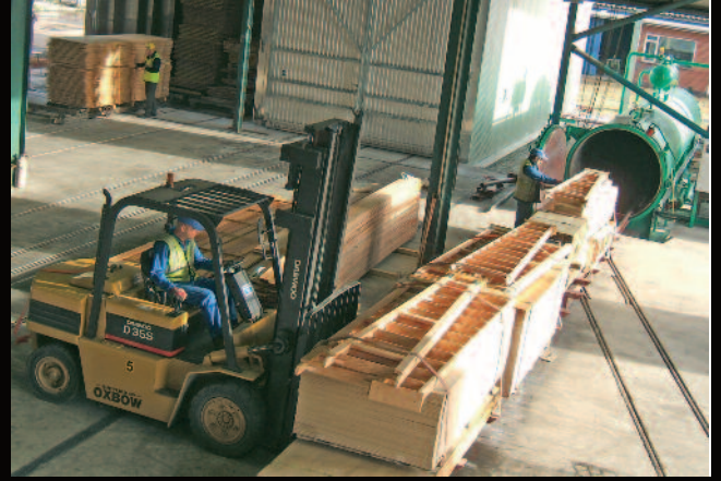
Arch's fire retardant treatment centre - the only one of its type in the UK, operating with ISO 9001 and ISO 14001 accreditations. Treatments involve high pressure impregnation followed by careful kiln drying/heat curing.

With regard to certification against relevant standards, currently there is a transitional stage between traditional British Standards and new European classifications. Eventually, over the next few years, the European classifications, referred to as Euroclasses, will become mandatory for materials used for permanent constructions. To support a Euroclass performance, classification reports from a notified body according to BS EN 13501-1 are a definite requirement.