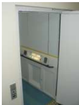
The new lift complete and ready for use.