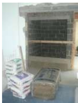
Building work for the new lift.