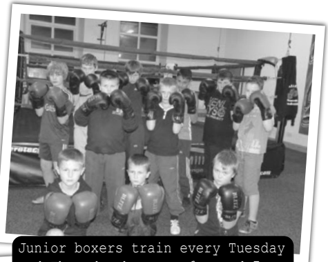
Junior boxers train every Tuesday and Thursday between 6pm and 7pm