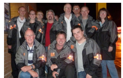
Cleethorpes Street Angels

After a break for a feast of cakes, buns, pastries and other delights that everyone had brought along, we went off into smaller groups to allow everyone to share highlights from their own project. We closed by praying for the region. The feedback that we've had has been really encouraging and there are already plans for something similar next year.